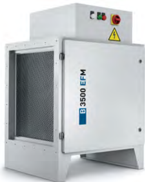
Modular filter B 3500 EFM – the powerful basis for island solutions and centralised systems up to 42000 m 3 /h.

use modular filters, which are flexible in terms of design and mounting. Our experience and know-how also allow us to align the pipeline system with your building technology. Planning and implementation are provided from a single source. For higher availability levels of the filter units and the production resources, we recommend the flexible and fast Bristol-CleanService.