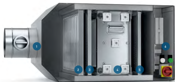
Design electrostatic filter B 1000 EF Air direction horizontal from left to right:

All accessories required for custom designs are part of our permanent product portfolio.