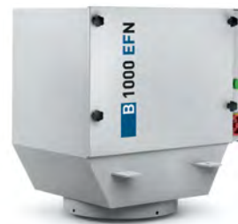
Electrostatic individual filter B 1000 EFN. Efficient and compact after filter for centrifugal separators.