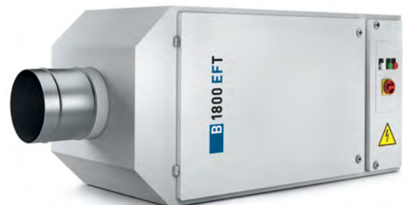
For extreme particle pollution – tandem individual filter B 1800 EFT for higher separation levels.

All Bristol filters are sturdy and oil leak proof; the performance and efficiency of the components have been optimised.