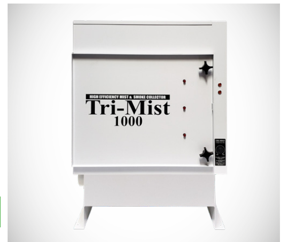
Tri-Mist 1000 with optional machine stand and plenum